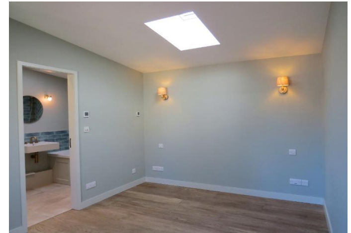
AVAILABLE MID MAY 2023