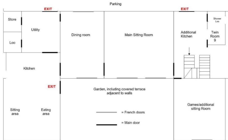
CROGEN COACH HOUSE: Ground Floor