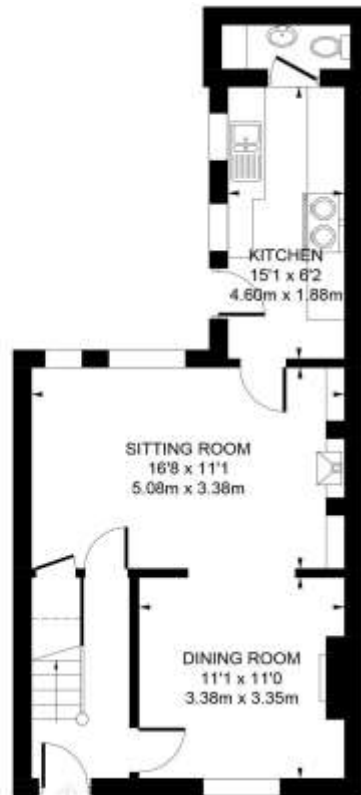
GROUND FLOOR APPROX. FLOOR AREA 505 SQ.FT (46.9 SQ.M)