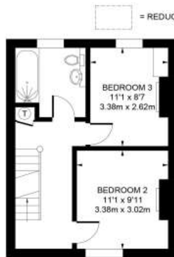
FIRST FLOOR APPROX. FLOOR AREA 381 SQ.FT (35.4 SQ.M)